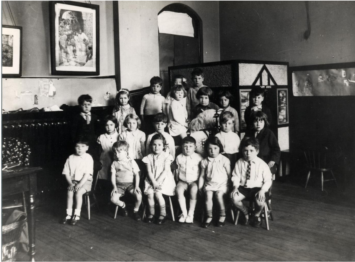
One of our visiting schools, but during a previous era Kingsgate Primary School 1938

Camden Local Studies and Archives Centre holds an extensive collection of information about the history of the London Borough of Camden and its predecessor authorities of Hampstead Holborn and St Pancras. This comprises primary and secondary sources such as maps, pictures, books, newspapers, correspondence.